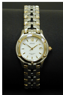
"TOP ORDER WRITER'S CLUB WATCH" 195 Orders per Quarter